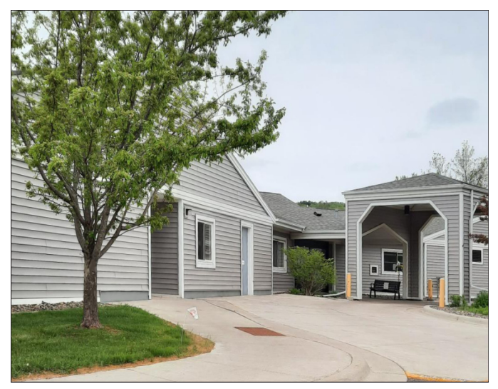
New siding at Redruth Valley Apartments in Duluth, Minnesota