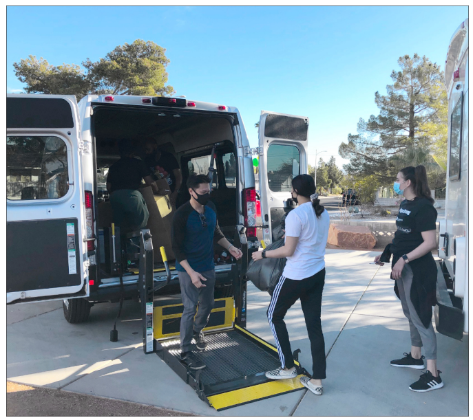
New residents move to ASI Spencer with transportation via an accessible van.

Anyone interested in receiving information on ASI Spencer or services provided by the Nevada Community Enrichment Program (NCEP) should call 702-259-1903 or contact via fax 702-259-1907.