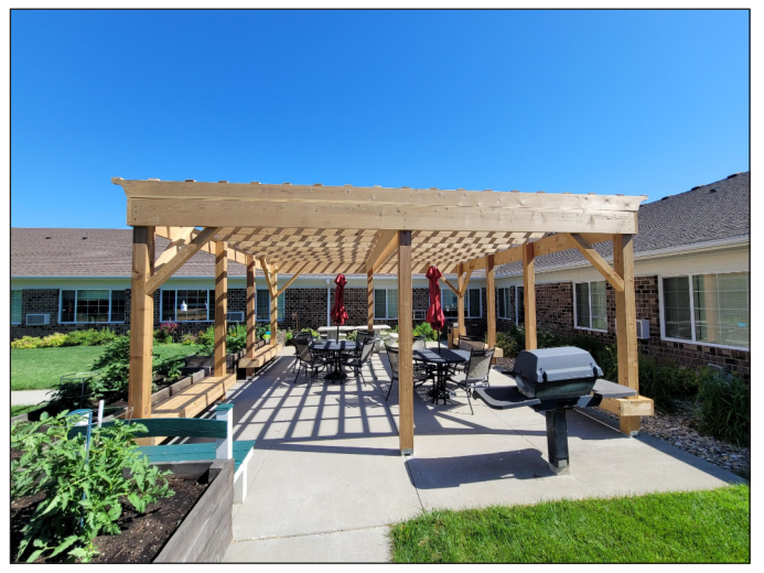
New pergola at Pheasant Run Apartments in Brookings, South Dakota

Cedar House in White Bear Lake and Snelling House in Falcon Heights were both awarded funding from Ramsey County, Minnesota for new kitchen cabinets and counter tops; new flooring in units, garage door replacement; window replacement; bath remodel; and general interior painting.