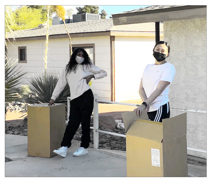
ASI's Direct Support Professionals posing with packed boxes.