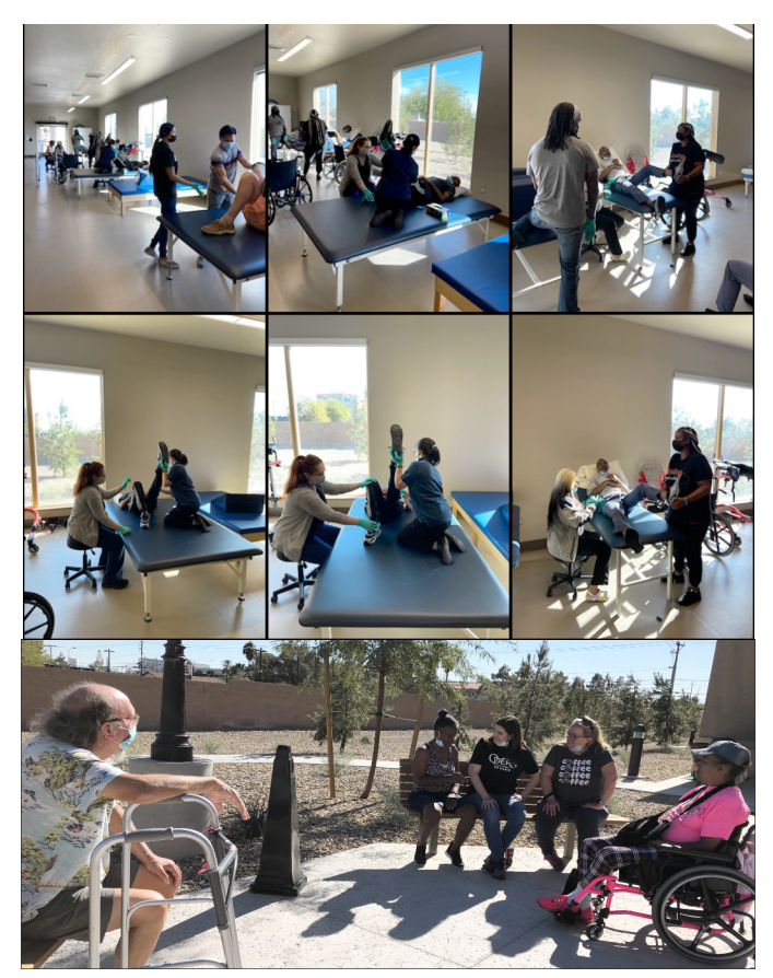
Residents converse and work on their rehabilitation therapy on move-in day.