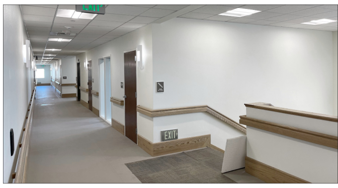
Second floor hallway