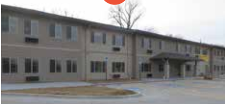
ASI opened its first building in Oklahoma, Rock Ridge Apartments in McAlester.