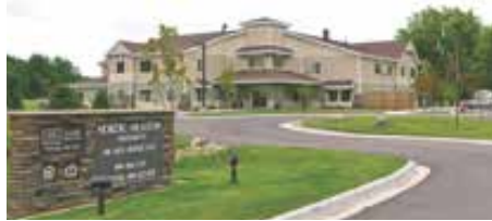
ASI's 39th building in Minnesota opened: Nordic Meadow Apartments in Alexandria.