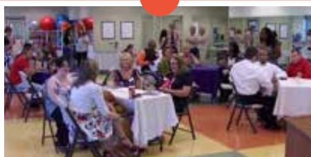
The Nevada Community Enrichment Program (NCEP) celebrated its 20th anniversary.