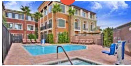
ASI partnered with Ovation Development Corporation to develop two Low-Income Housing Tax Credits (LIHTC) buildings in Las Vegas, Nevada totaling 283 units of affordable housing.