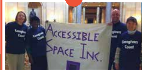
ASI staff joined approximately 500 seniors, caregivers, administrators, and supporters of long-term care at the Minnesota State Capitol.