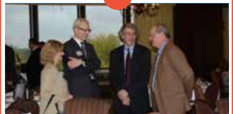
ASI conducted its first Mission Support Luncheon.