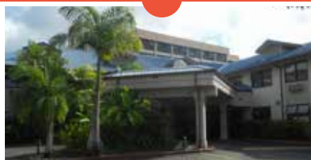
ASI assumed management of The Harry & Jeanette Weinberg Hale Kuha'o in Waipahu, Hawaii.