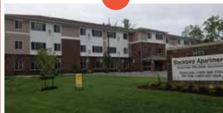
ASI's largest HUD Section 811 development—Blackbird Apartments—opened in Kansas City, Kansas, offering 32 accessible, affordable units.