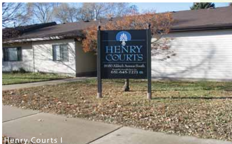
Henry Courts I