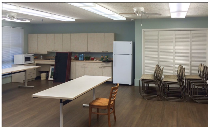
Renovations at The Harry & Jeanette Weinberg Hale Kuha'o included new paint in the community room (above) and extensive plumbing repair in the resident bathrooms.

Renovations to Casa Norte in Las Vegas, Nevada were completed on April 27, 2016. The project began on October 16, 2015. The building's capital improvements were fully funded by Clark County Community Development Block Grant (CDBG) funds. Improvements include rehabilitation and a building addition that accommodates a new office and three new residential units; replacement of aging and code deficient mechanical and electrical systems; a bathroom rehabilitation and expansion; new energy efficient windows; and a wheelchair accessible sidewalk from rear exit to the front drive. The office was removed from the existing living room; previously combined resident units were expanded back to their original single resident use size; common use