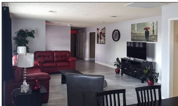
Interior and exterior improvements at Casa Norte.

Work has begun on Pesch Place in Golden Valley, Minnesota . Rehabilitation funds were provided through the City of Golden Valley/Hennepin County