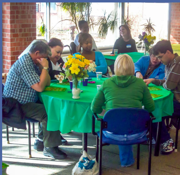
MARP and ASI hosted the 2009 Bingo Event.

MARP is an organization of case managers and counselors working with adults with injuries and disabilities. The event was held at Neill High Rise in Saint Paul, Minnesota. ASI appreciates MARP's interest in our residents and staff. Plans are already in the works for next year's event.