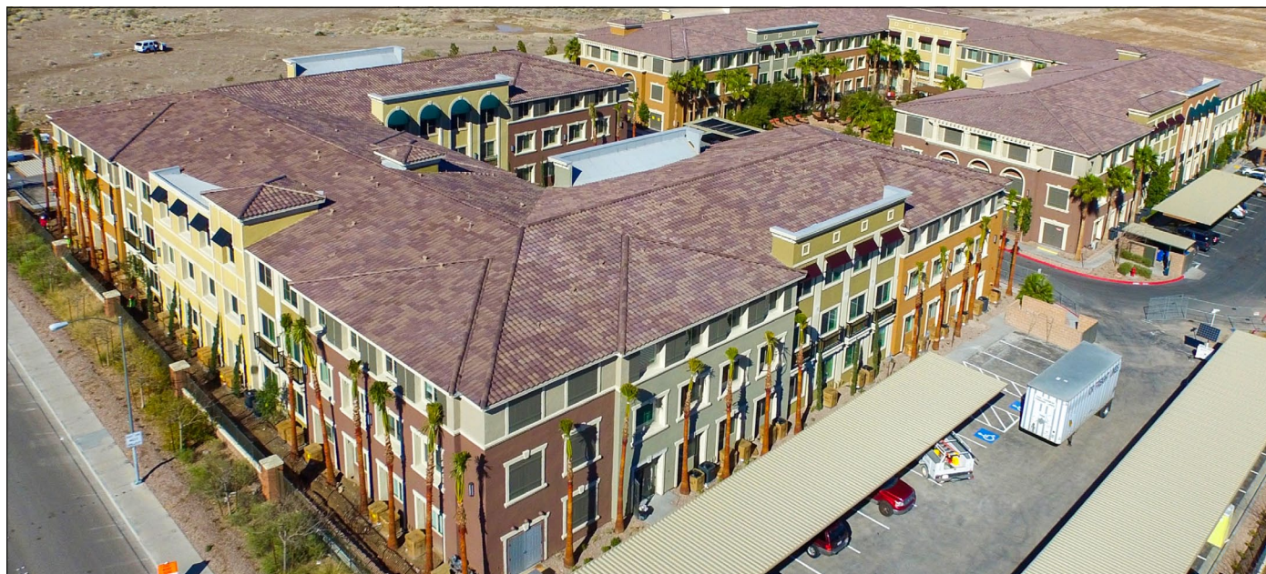
Tempo Senior Duet Apartments (Russell Senior Apartments Phase II)

To apply for housing online, click on the housing link at the top of this page: http://www.accessiblespace.org/