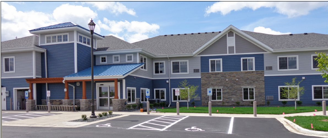
Tribute Commons Hudson, Wisconsin