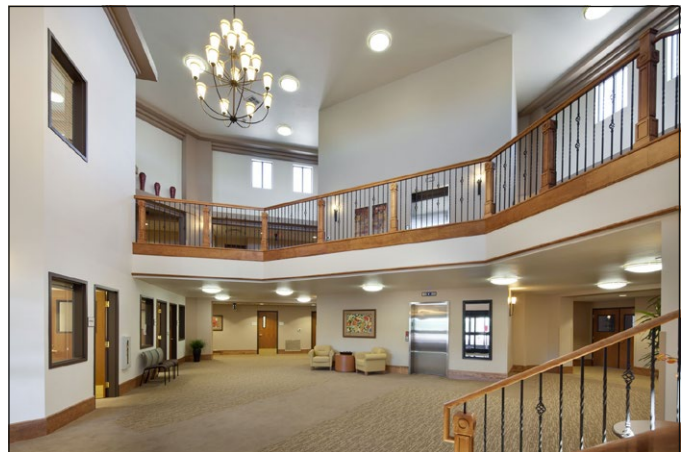
Above and below: Interior photos of Coronado Drive Apartments

ASI staff are eager to have this opportunity to expand ASI's managed housing portfolio with this transition, the completion of which will set ASI on a course for the future management of other LIHTC funded housing sites across the nation. These include existing LIHTCs in Colorado, Montana, as well as in Nevada – starting with ASI's Patriot Place Apartments currently under construction in Las Vegas. ASI staff looks forward to the continued steady growth of ASI's managed portfolio, and I thank everyone who has supported and assisted in our efforts to reach this milestone. It truly takes a village to do what we do and meet mission with nearly 3,004 residents at more than 136 housing sites in 25 states across the nation, and more to come!