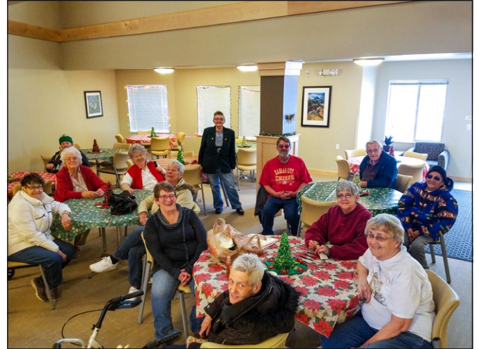
Voyageur Apartments residents enjoy their first Holiday Party.