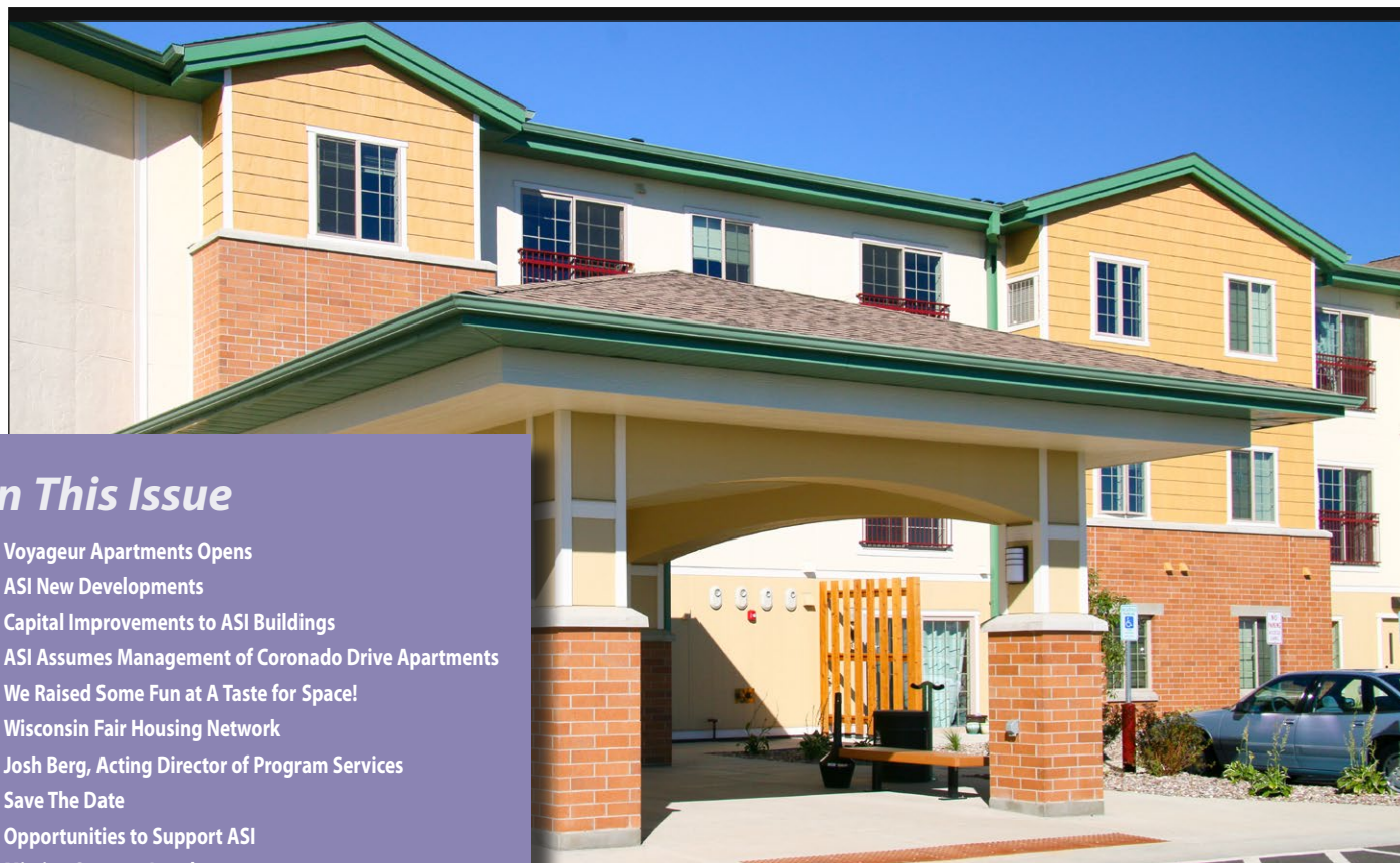
Voyageur Apartments in Great Falls, Montana was completed on June 21, 2016.