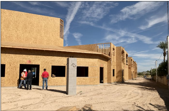
On May 25, 2016 construction began on Patriot Place Apartments in Las Vegas, Nevada.

For more information on Voyageur Apartments please see the story on Page one.