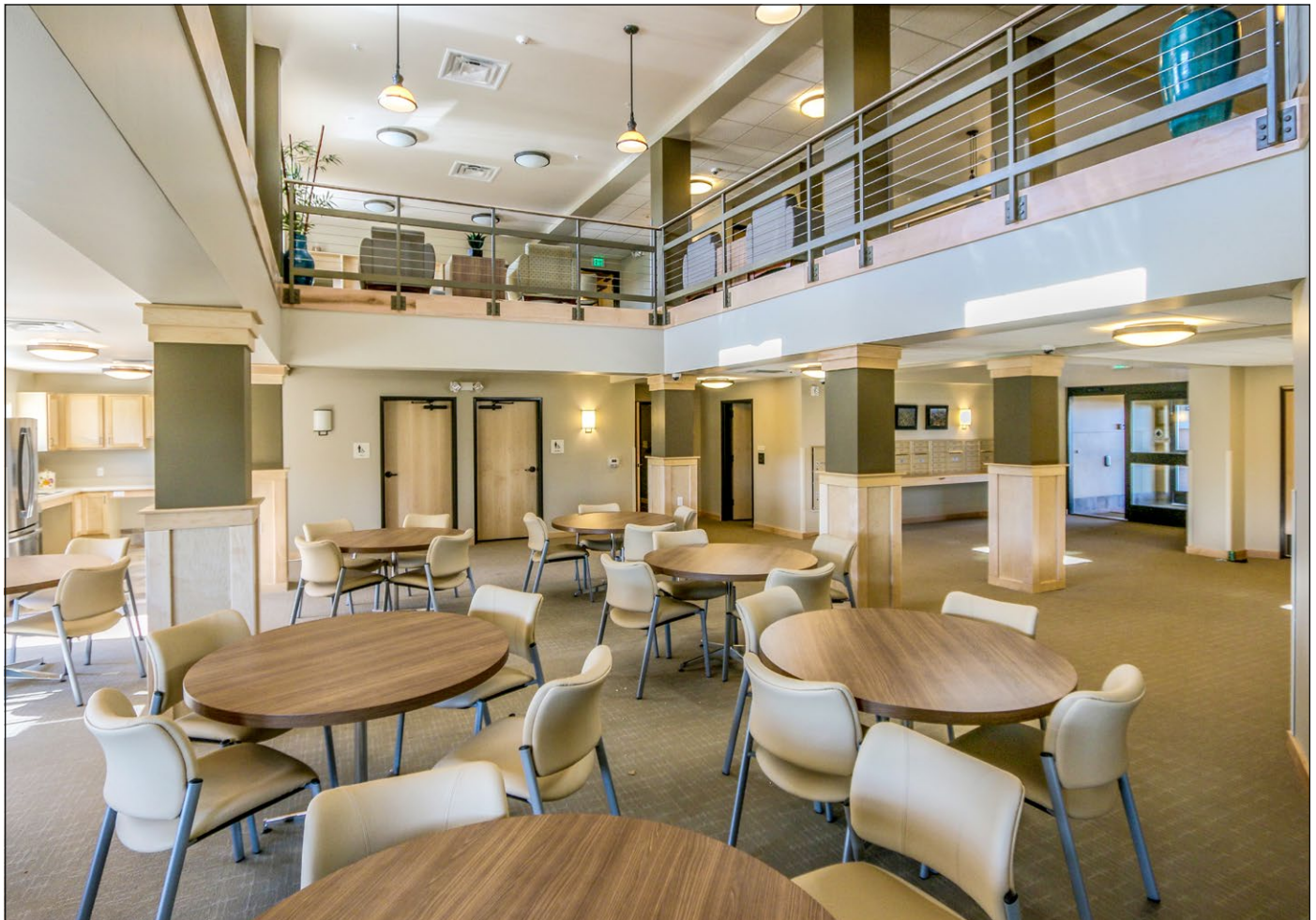
Commons area of Voyaguer Apartments, Great Falls, Montana

To apply for housing online, click on the housing link at the top of this page: http://www.accessiblespace.org/