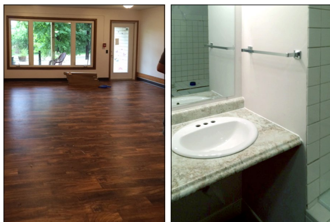
Improvements at Pesch Place: New flooring and bathroom renovations

On behalf of the Board, residents and staff of ASI, we offer our sincere thanks to those individuals and organizations providing support during the past several months. The support provided by these individuals, foundations, corporations and government agencies is critical in ASI's continued development of accessible, affordable housing and supportive care services across the United States.