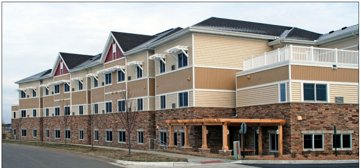
Heirloom Court Hudson, Wisconsin