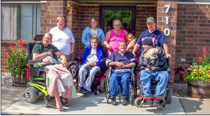
Residents of Winston Courts Apartments in Hibbing, Minnesota