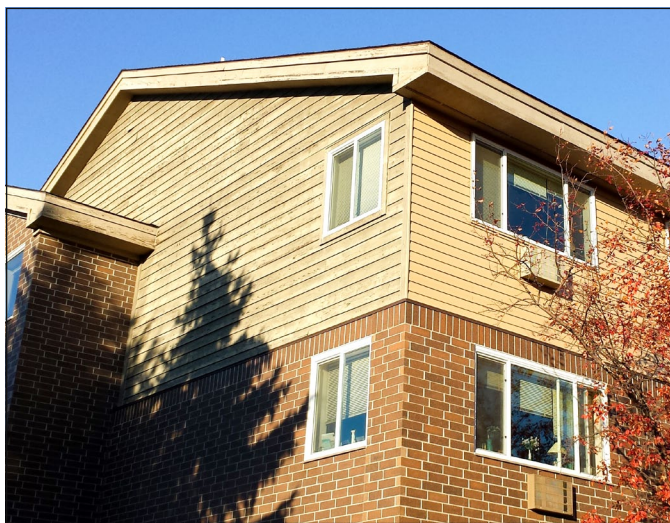
Quarry Heights Apartments in St. Cloud, Minnesota is in the process of renovations to maintain this 20 year old building. This photo contrasts the re-sided front with the side that will be re-sided.

Quarry Heights Apartments in St. Cloud, Minnesota is in the process of renovations to maintain this 20 year old building. In Spring 2015 the front of the building was re-sided. The remaining capital improvements include siding replacement, a new roof, painting of fascia and soffits, parking lot resurfacing, a replacement card reader for the main entrance and an automatic door opener for the laundry room. ASI's Fund Development Department is submitting grant applications for this work.