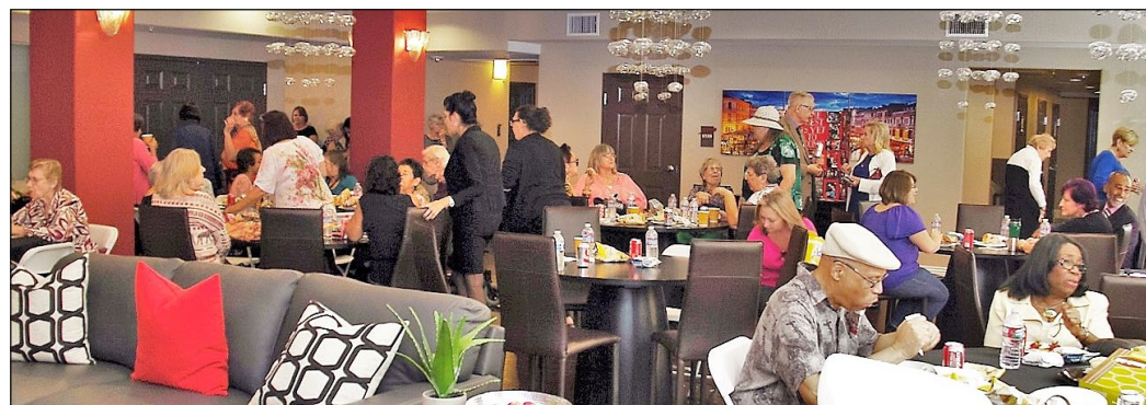
Residents and guests enjoy refreshments at the Ensemble Senior Apartments Open House and Dedication Ceremony.