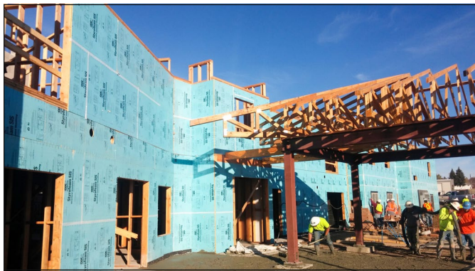
Voyageur Apartments began construction on April 6, 2015.

In 2012 Ovation Development Corporation of Las Vegas, Nevada requested ASI serve as the nonprofit partner for four of its developments.