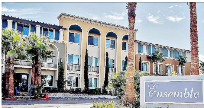
Ensemble Senior Apartments in Las Vegas, Nevada was completed on June 15, 2015.

On October 22, 2015 an Open House and Dedication Ceremony was held for Ensemble Senior Apartments in Las Vegas, Nevada. Ensemble Senior Apartments is located at 2675 West Agate Avenue (between Las Vegas Boulevard and I-15, near West Pebble Road), Las Vegas, Nevada 89123.