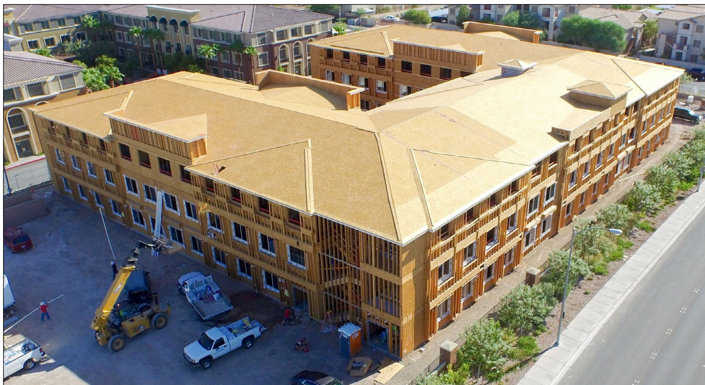
Tempo Senior Duet Apartments (Russell Senior Apartments Phase II) began construction on April 6, 2015.

Apply for housing online at: http://www.accessiblespace.org/housing/index.php