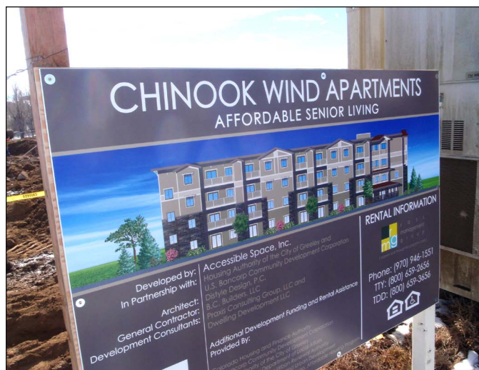
Chinook Wind Apartments in Greeley, Colorado began construction on January 8, 2014.

Anyone interested in receiving information on ASI's newest developments should contact ASI's Property Management Department at (800) 466-7722. Your call will be directed to the appropriate Property Manager.