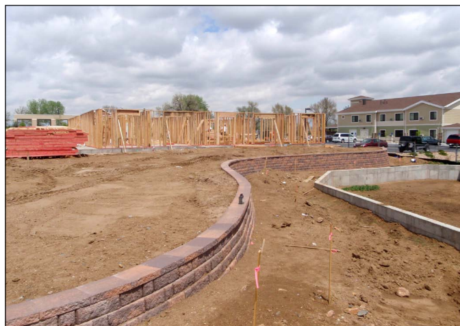
Chinook Wind Apartments construction progress as of May 8, 2014.