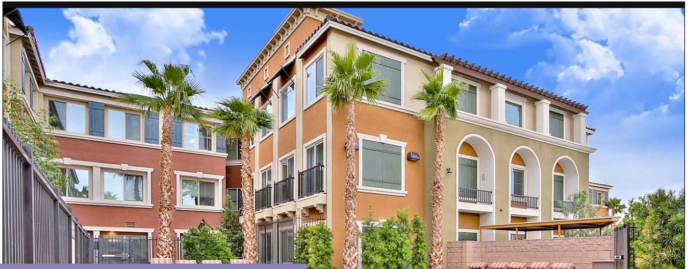
Tempo Apartments in Las Vegas, Nevada