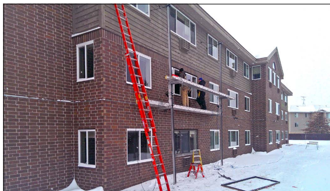
Above, windows were replaced at Quarry Heights Apartments in St. Cloud, Minnesota. Below, a new roof was installed on Henry Harbor Apartments in Corpus Christi, Texas.

Van Buren House in Blaine, Minnesota is a four unit accessible, affordable residence for very low-income adults with traumatic brain injuries. Funds to replace the roof, concrete driveway and sidewalks were provided by the Anoka County Community Development Block Grant (CDBG) Program. This work should be completed in the summer of 2014.