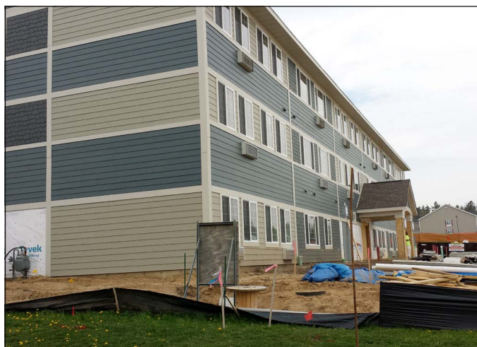
Rolling Prairie Apartments in Freeport, Illinois began construction on October 2, 2013.